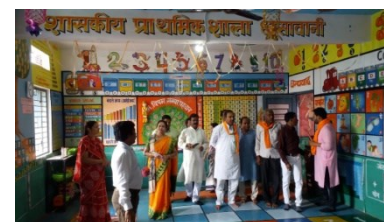
Staff DIET Chhidwara, MLA and other leaders, officers, and villagers visiting the "Activity ROOM" in Primary School, Dhusavani